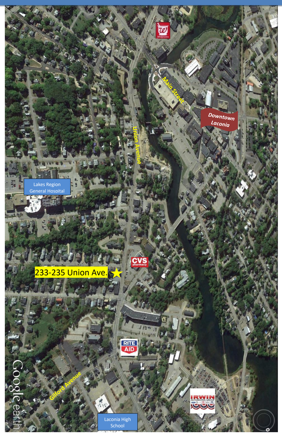
NOTICE: The information provided herein is believed to be accurate, but Weeks Commercial, its salespersons and employees do not warrant or guarantee its accuracy in case of error or mistake. Therefore, it is recommended that all information be verified, and that the professional advice of an attorney and/or an accountant be sought before executing any contractual agreement.